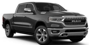
2019 Ram 1500 Big Horn/Lone Star Crew Cab 4x2 - 5,700 lb. Sponsor